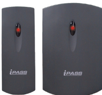
iPASS IP10 / IP20 Bezel (1ea)