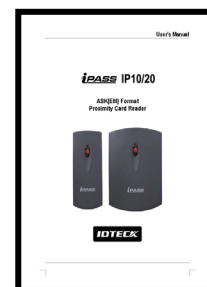
User's Manual (1copy)