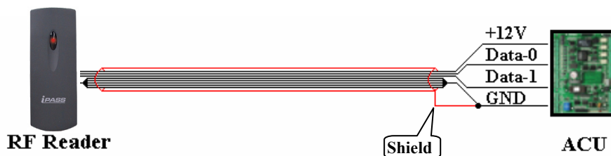
< Reader connection using additional wires >