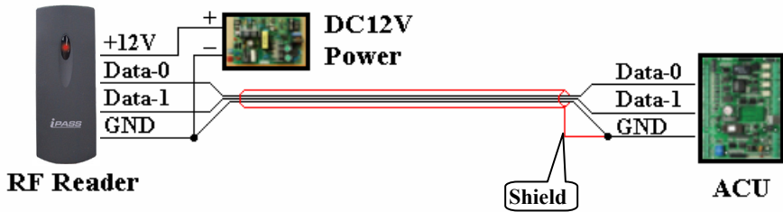
< Reader connection using external power supply >